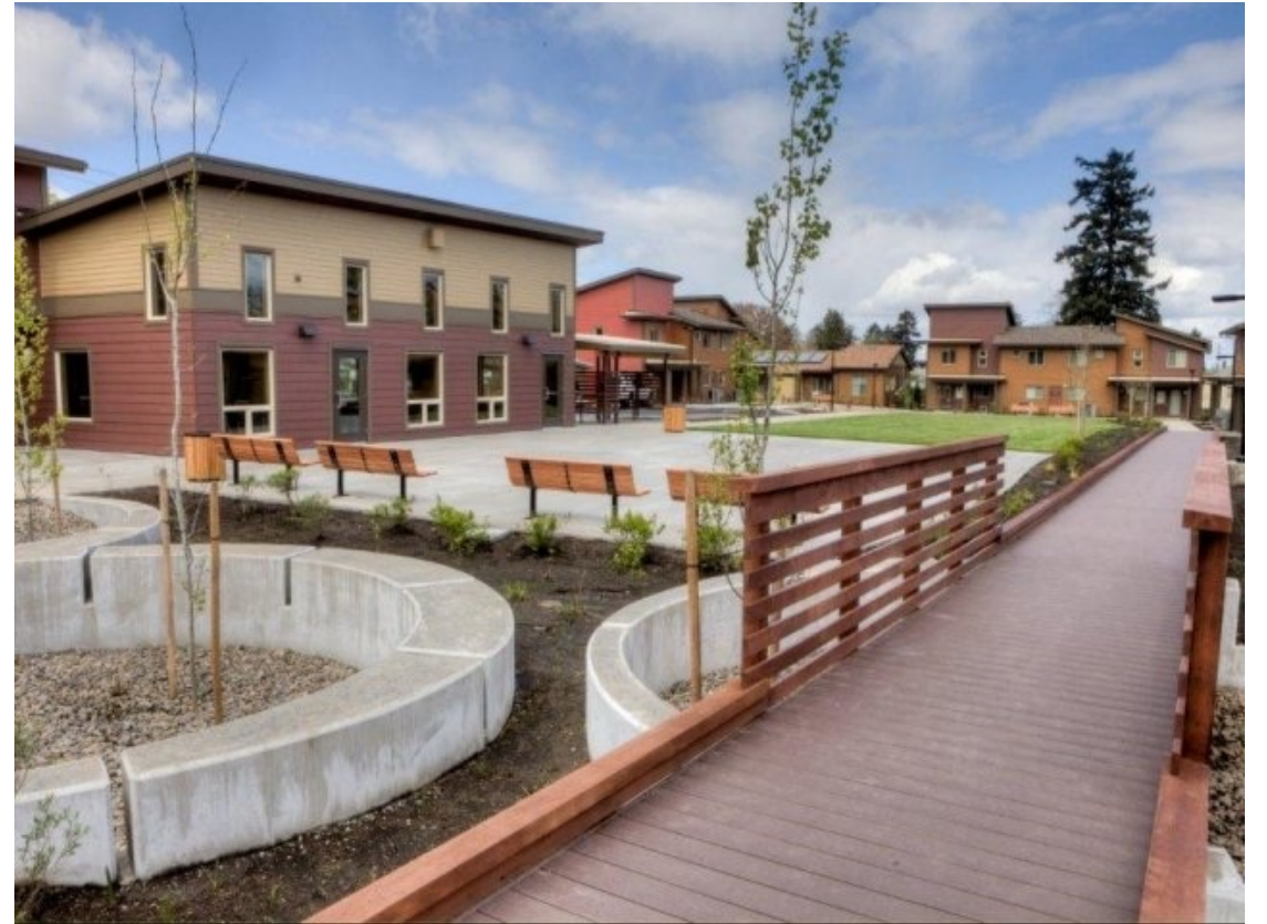
North Portland Bridge Meadows Campus