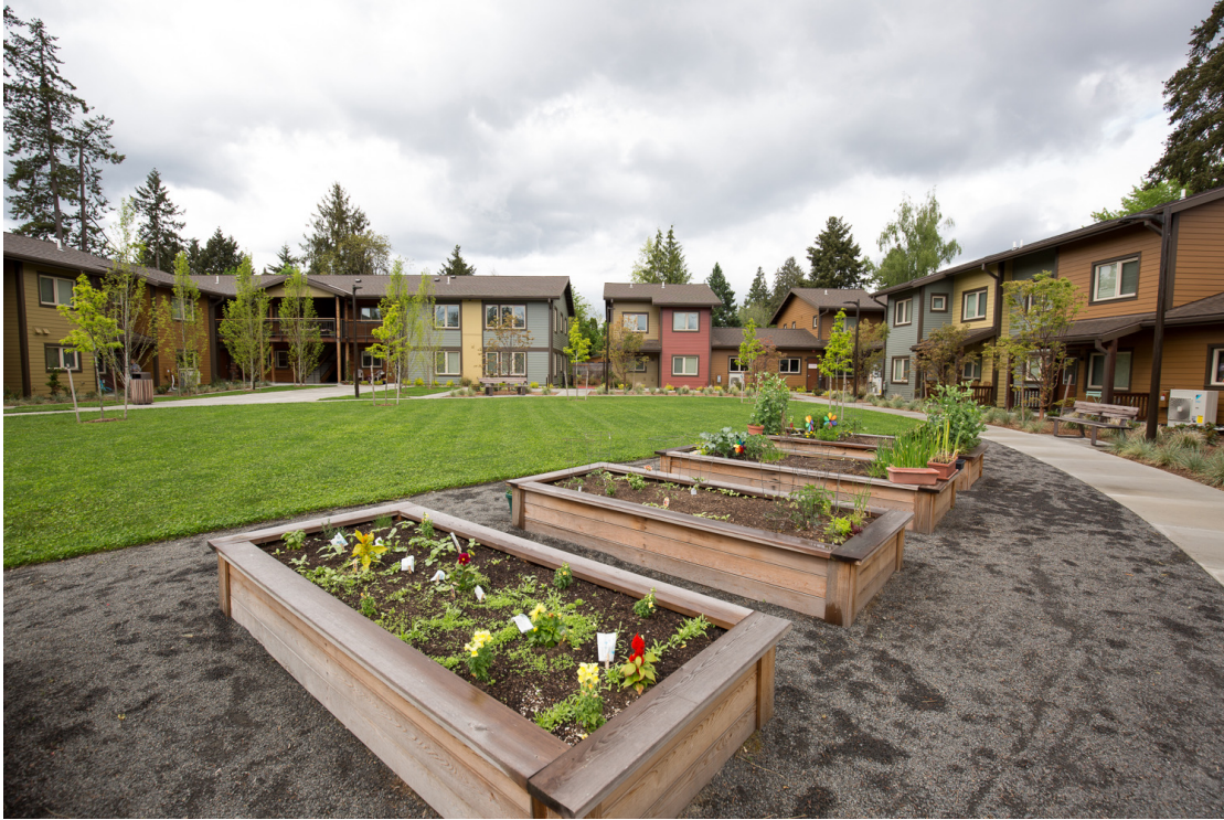
Beaverton Bridge Meadows Campus