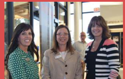
Brooks Resources sponsored our Membership Social, held in October 2014 at the Umpqua Store Century Drive.