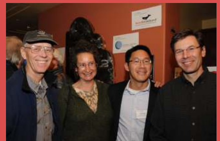
City Club of Central Oregon was the presenting sponsor of Bend2030's first ever Super Forum held January 2014.